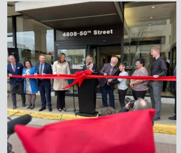
Centre for Social Impact