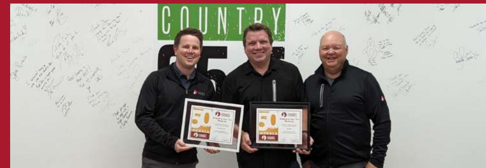
Real County 95.5