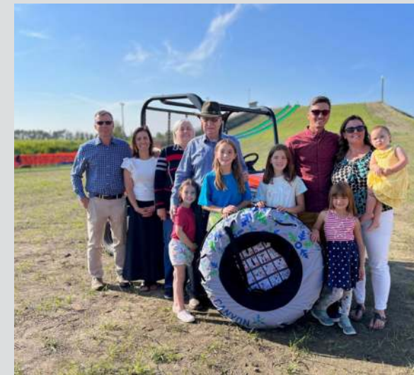
Canyon Summer Tubing Slide

We helped 16 businesses celebrate a multitude of milestones, from grand openings to ground breakings.