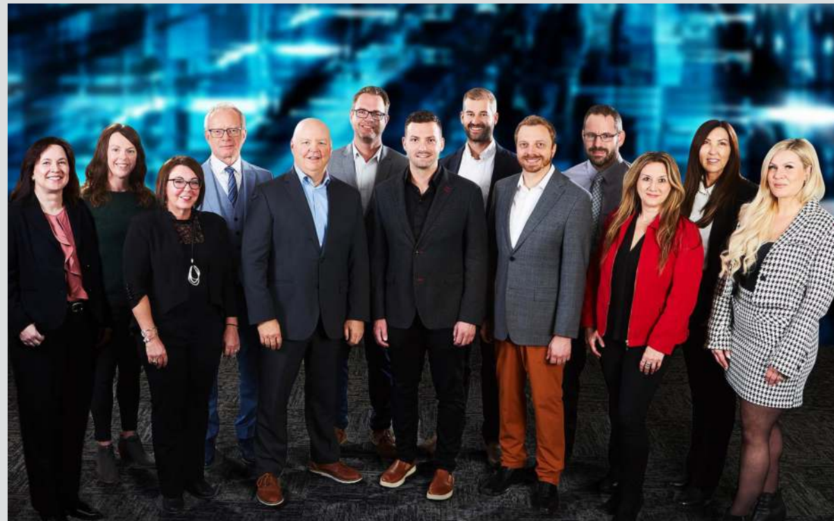
2022-2023 Board of Directors